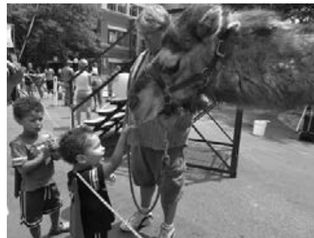
Kids' Corner is a very special part of the event.