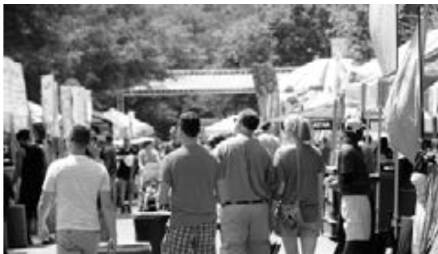
There is much to see and do at the Music Festival & Garden Walk.

Additional sponsors this year include: Lakeshore Sport and Fitness, 97.1 – the Drive, St. Vincent DePaul Church, Wintrust Financial, Treasure Island Foods, DePaul University, Christy Webber Landscapes, Christy Webber Farm and Garden, Home Depot–Lincoln Park on Halsted, the Reader, Screamin Sicilian, Sparkling Ice, ArcLight Cinema, Language Stars, Sprint and Emmi Cheese. Their sponsorship helps us ensure that the Sheffield Music Festival & Garden Walk will be a financial success, generating funds for the operation of the Sheffield Neighborhood Association and allowing