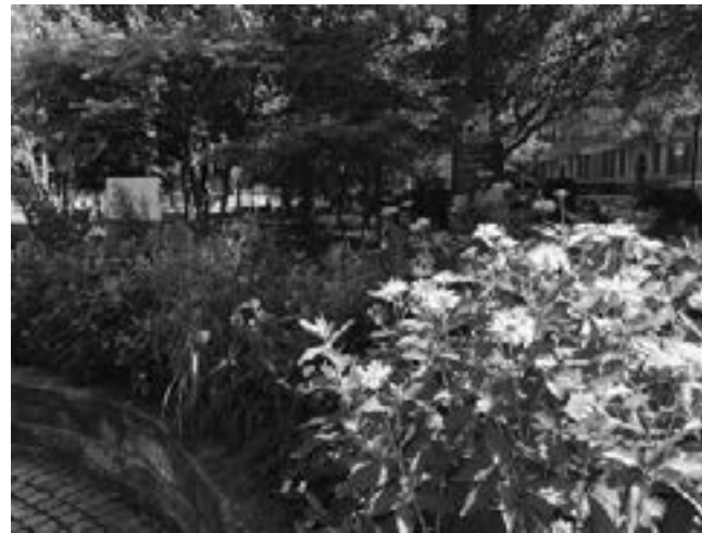
Trebes Park will host a wide variety of native plants.