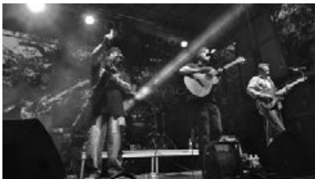
Top bands wow the crowds every year at the SMF&GW.