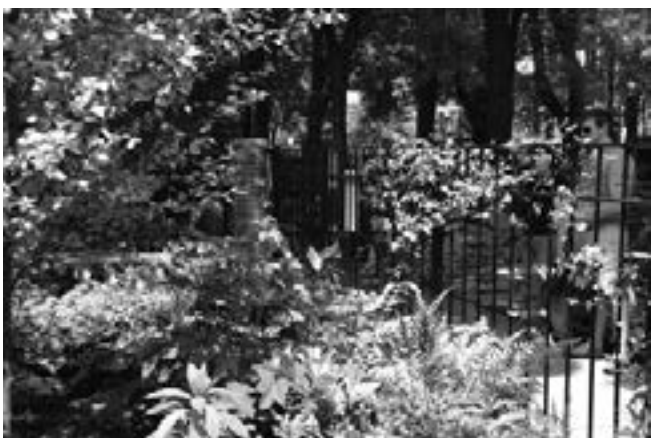
More than 75 gardens will be on display.

The Sheffield Neighborhood Association was instrumental in helping Little Sisters of the Poor create an award-winning enabling garden for its residents located at Magnolia and Belden. Please stop by and enjoy its garden as well as the music of Barry Winograd and the Alternatives Big Band on both days.